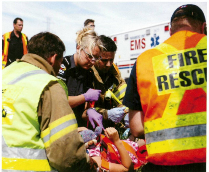
Medical response team works with fire fighters on the scene of a collision.

An MFR-focused Patient Care Report (PCR) has been developed and trialed with several MFR agencies from