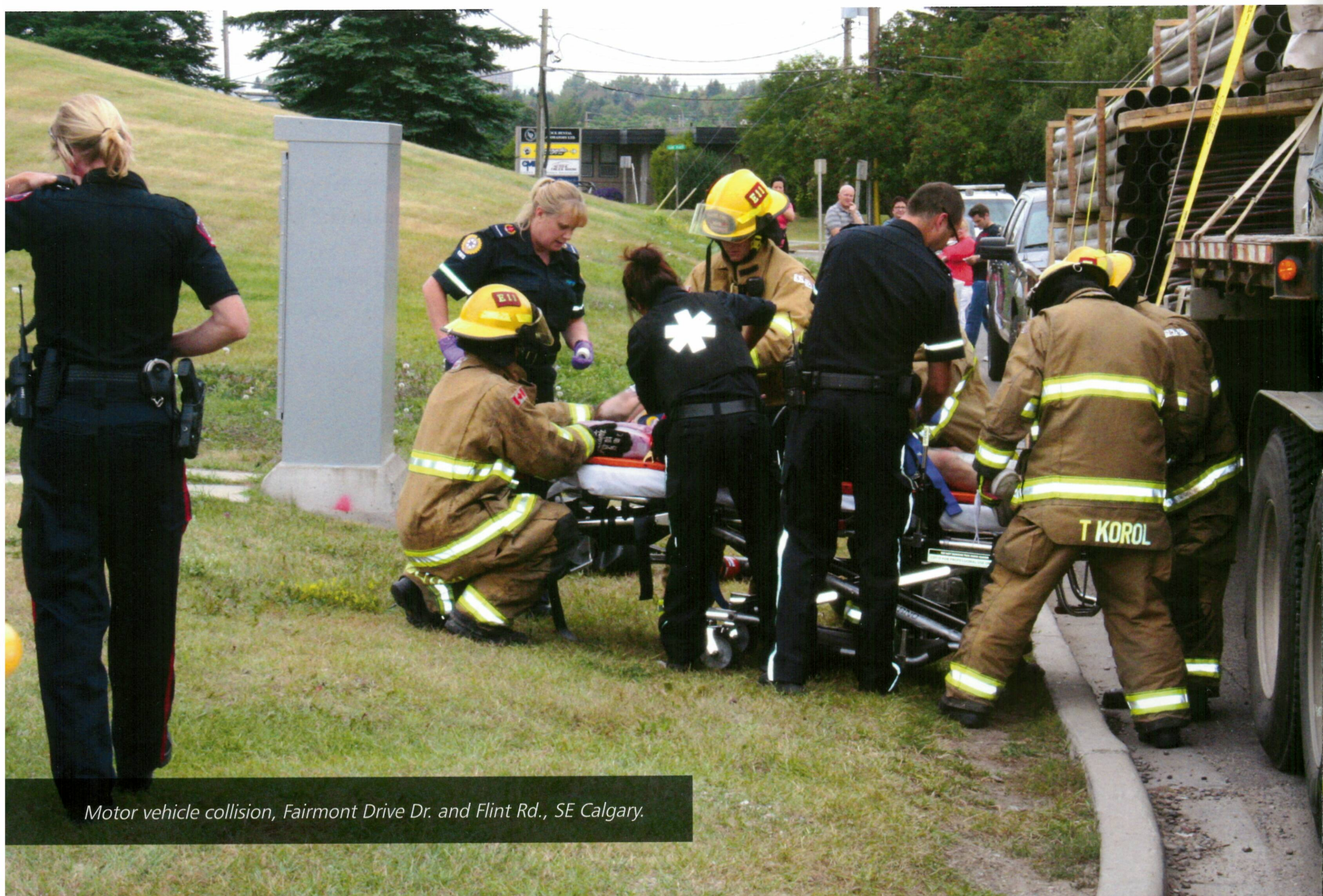
Motor vehicle collision, Fairmont Drive Dr. and Flint Rd., SE Calgary.

The MFR Program continues to collaborate with stakeholders including the Alberta Fire Chiefs Association. MFR information sharing was recently featured at many of the AFCA regional spring meetings throughout the province and AHS will participate in the AFCA 2015 Convention in Red Deer including an address to the Convention delegates on May 27th. AHS proudly supports agencies and responders as a partnership with EMS for the benefit of all Albertans. Contact the Alberta MFR Program at MFR@albertahealthservices.ca or call toll free 1-866-786-1140. The Alberta MFR portal is located at www.AlbertaMFR.ca .